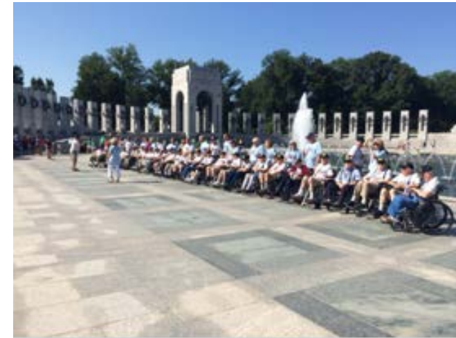
Maine Veterans at the World War II Memorial