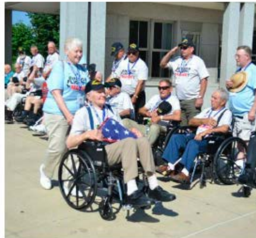
Maine Veterans at the World War II Memorial