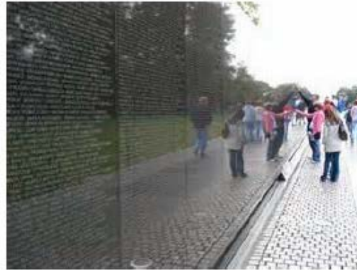
The Vietnam War Memorial