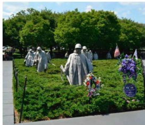
Korean War Memorial